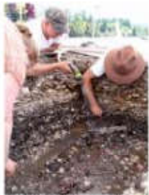
Wet Site Excavations, Thurston County