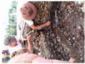
Wet Site Excavations, Thurston County