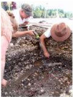
Wet Site Excavations, Thurston County