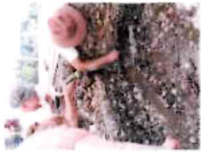
Wet Site Excavations, Thurston County