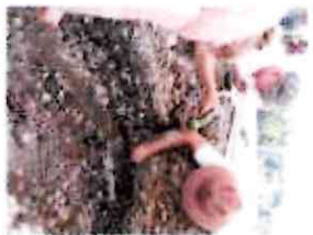
Wet Site Excavations, Thurston County