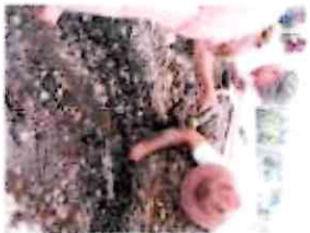
Wet Site Excavations, Thurston County