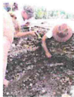
Wet Site Excavations, Thurston County